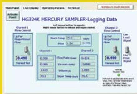
Logging data is simple with our visual interface allowing up-to-the-second calculations.