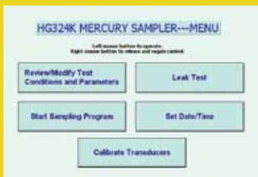
The initial page offers quick navigation to the main 5 programs of the sampler.