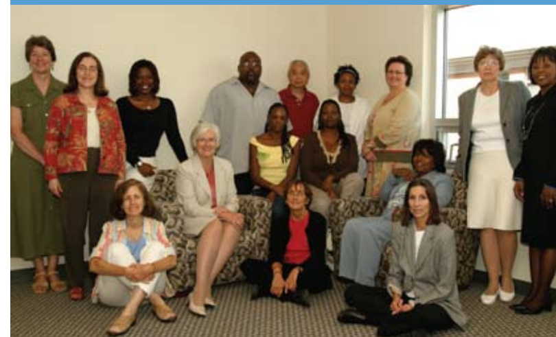
School of Nursing faculty and staff involved in developing the Psychiatric Mental Health Nurse Practitioner Program.